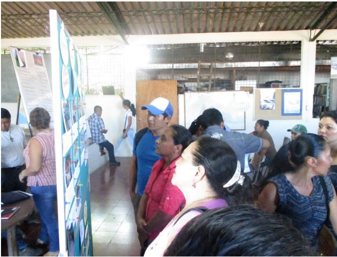
Exhibition of photographs produced by the Picture Power participants