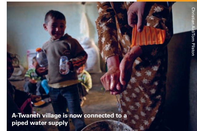
A-Twaneh village is now connected to a piped water supply

The success of this campaign is about more than water. It's about the result that ordinary people can have when they stand against injustice, and for human rights.