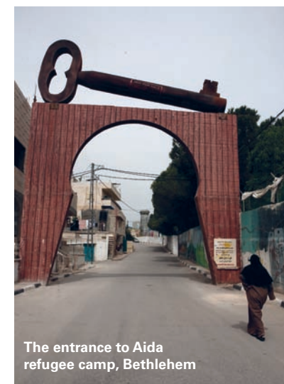
The entrance to Aida refugee camp, Bethlehem

Our partners stand up for their beliefs, often at great cost, to bring about positive change in peoples' lives.