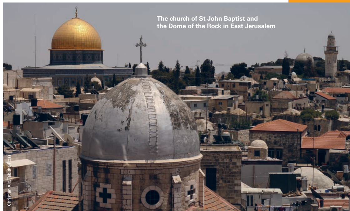
The church of St John Baptist and the Dome of the Rock in East Jerusalem

34.5% of Palestinians live below the poverty line 1