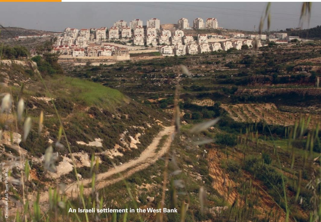
An Israeli settlement in the West Bank

9x more water is consumed per capita by Israeli settlers in the West Bank than Palestinians 9