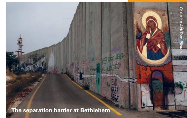
The separation barrier at Bethlehem

622 structures owned by Palestinians were destroyed in 2011 7