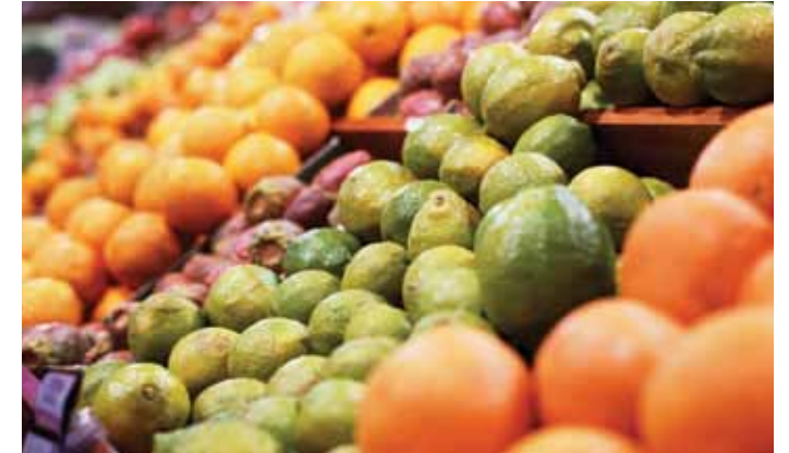
▲ Citrus fruits being sold in a supermarket.

The discrepancy is largely driven by Israel's generous incentives for settlement businesses and the crippling restrictions imposed on the Palestinian economy described in the preceding chapter. By importing vastly more from settlements that are taking advantage of the occupation than from producers living under the occupation, Europe is helping entrench the discriminatory two-tier system in the West Bank.