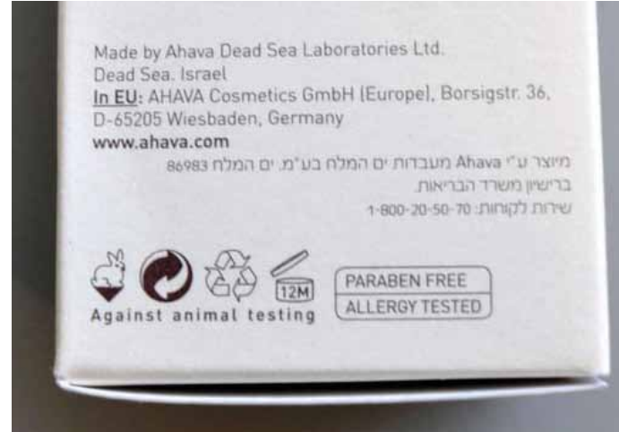
▲ The company Ahava labels their products “Made in Israel”, despite the fact that they are manufactured in a settlement in the occupied Palestinian territory. The postal Code 86983, shown in tiny characters on the packaging, is the postal code for the Israeli settlement Mitzpe Shalem by the Dead Sea.

SodaStream produces home devices for carbonation of water and soft drinks. SodaStream products, also known under the brand name Soda Club, are sold at more than 35,000 stores worldwide and 68% of sales are in Europe.