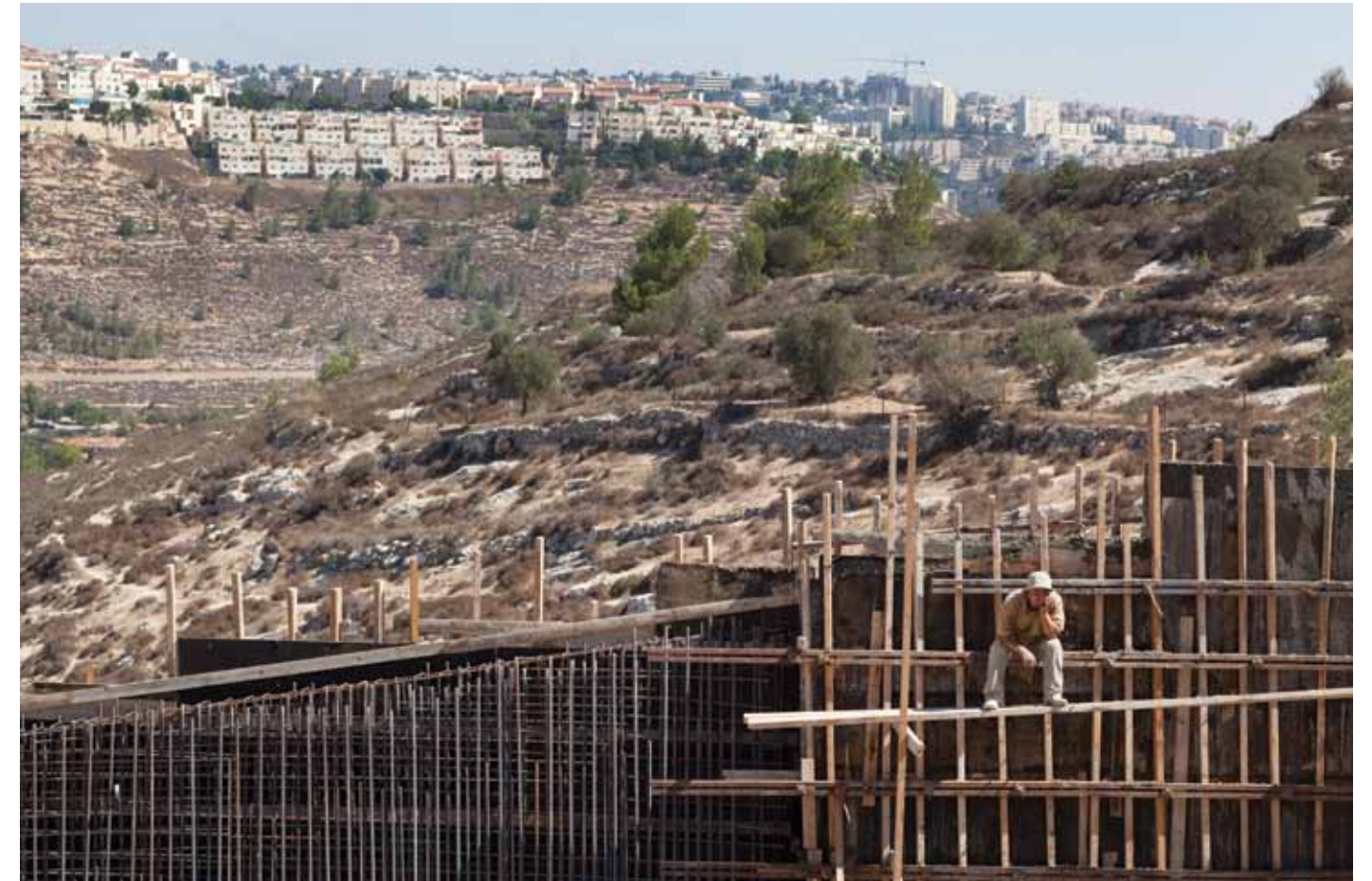
▲ The construction of the Wall in the Palestinian village of Al Walaje which has been surrounded by thousands of settlement units in the Gush Etzion bloc.

Through the establishment of settlements, Israel has created a discriminatory two-tier regime in the West Bank with two populations living separately in the same territory under two different systems of law. While settlers enjoy all the rights and benefits of Israeli citizens, Palestinians are subject to a system of Israeli military laws that deprives them of their fundamental rights. 17