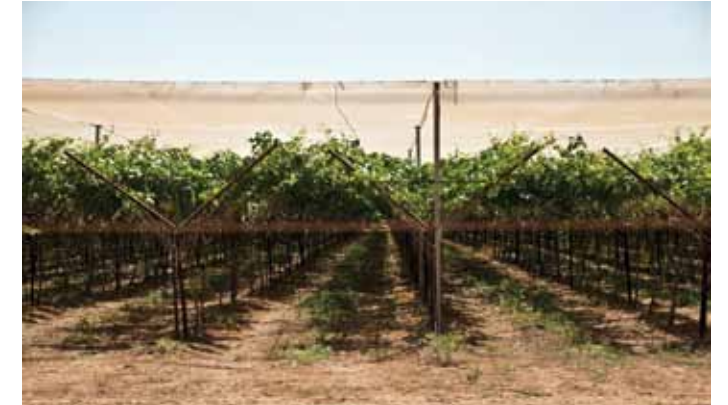
▲ Vineyards that form part of an illegal Israeli settlement in the Jordan Valley in the West Bank, built on confiscated Palestinian land.

Settlements have established modern agribusinesses and industrial zones that produce high value goods for export to the EU and international markets. This is partly due to the special incentives provided by the Israeli government.