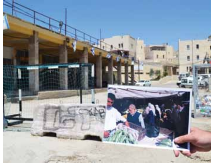
▲ A photo contrasts life in a busy Hebron market in 1999 and life on that street today. The old centre of Hebron has been closed to Palestinians, turning the city into a ghost town.

Obstacles to movement of goods: While settlers enjoy easy and direct access to Israeli and international markets, all Palestinian goods destined for Israel or further export must pass through Israeli checkpoints where they are unloaded from Palestinian vehicles and extensively checked before they can be re-loaded onto an Israeli vehicle on the other side (the so-called ‘back-to-back’ system). This is extremely time-consuming and often damages the products. Palestinian goods destined for international markets then pass through Israeli port and airport terminals where they face further disadvantages, obstacles and excessive time delays. All these obstacles significantly reduce the competitiveness of Palestinian products and increase the unpredictability of their delivery times and quality. 85