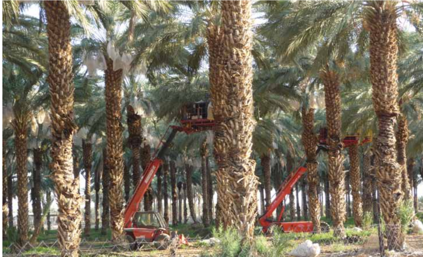
▲ Palestinians harvesting dates in Tomer settlement, Jordan Valley.