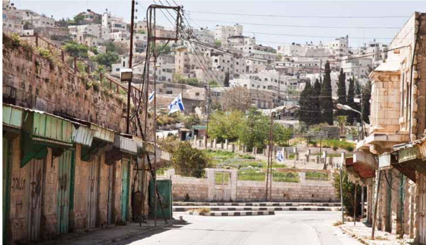
▲ Some streets in the old centre of Hebron are now off limits to Palestinians due to the presence of settlers in the centre of the city. Streets such as this were once busy markets but are now empty.