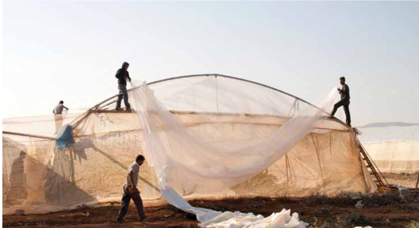
▲ Palestinians construct a greenhouse on an Israeli settlement farm in the Jordan Valley.

Water cisterns used by Palestinian farmers to collect rainwater are frequently demolished by the Israeli authorities (46 in 2011 alone), further limiting their ability to grow crops. 43 In addition, a growing number of water springs on Palestinian land in the vicinity of settlements have been taken over in recent years by settlers who have subsequently blocked Palestinian access to them. 44