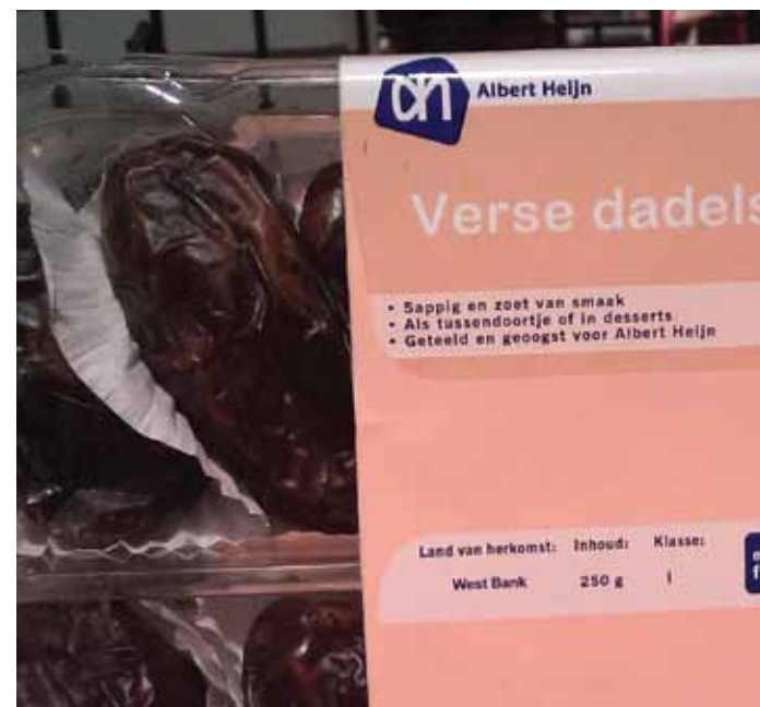
▲ Dates on sale in the Netherlands. The label reads "West Bank" which leaves the consumer unclear whether the fruits are from Israeli settlements or from Palestinian producers. After enquiry, the seller explained the dates were from Tomer settlement in the Jordan Valley.

The main Israeli exporter of dates is the company Hadiklaim. Hadiklaim appears to mark all dates as Israeli produce, making it difficult for the consumer to distinguish between dates from Israel proper and from the occupied Jordan Valley.