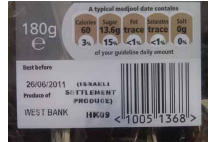
▲ Dates on sale in the UK. In accordance with the labelling guidelines introduced by the UK government in 2009, the label clearly states that it is “Israeli settlement produce”.

Danish FM Villy Søvndal announcing labeling guidelines. 147