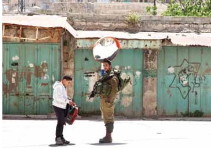
▲ Israeli soldier searches boy's school bag in Hebron.

Settlements are Israeli communities established on territory occupied by Israel since the 1967 Arab-Israeli war. Settlements are supported by an infrastructure including special roads, checkpoints, and the separation barrier dividing them from the surrounding Palestinian population. Settlements violate international law and UN Security Council resolutions and yet, throughout the 45 years of Israel's occupation of the Palestinian territory, every Israeli government has promoted continued settlement expansion.