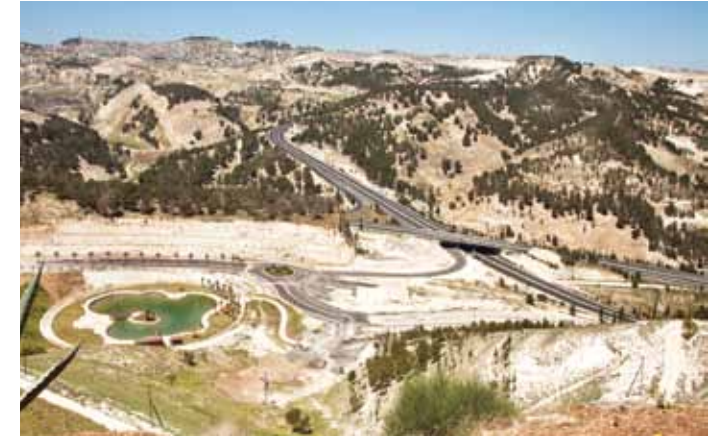
▲ An Israeli settlement on the outskirts of East Jerusalem. Settlements are being constructed around the city, cutting off Palestinian East Jerusalem from the West Bank. Despite widespread water shortages in Palestinian communities, many of these settlements boast swimming pools and water features.

Access to East Jerusalem also remains a major problem. Israel obliges any Palestinian who does not have residency rights in Jerusalem or Israeli citizenship to apply for a permit through a complicated and time-consuming process. This is also the case for medical patients accessing Palestinian hospitals in East Jerusalem. 19% of patients and their companions in the West Bank who applied for healthcare access in 2011 had their permits denied or delayed. 33 In a vast majority of ambulance transfers, patients must be moved from a Palestinian ambulance to an Israeli ambulance at a checkpoint before entering Jerusalem. 34