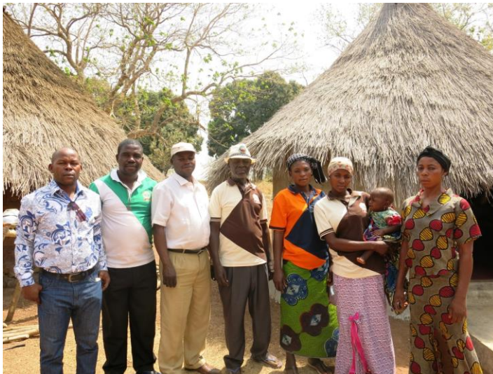
Members of Igbon CDC double-up as the WASH committee.

This approach to health education and promotion has worked effectively in Igbon 1 , a remote community in Logo Local Government Area, Benue state. In a community mainly populated by farmers and branda (retailers of farm produce), the CDC doubles as the water, sanitation and hygiene (WASH) committee, appealing to local government around health needs and promoting WASH principles to improve community health.