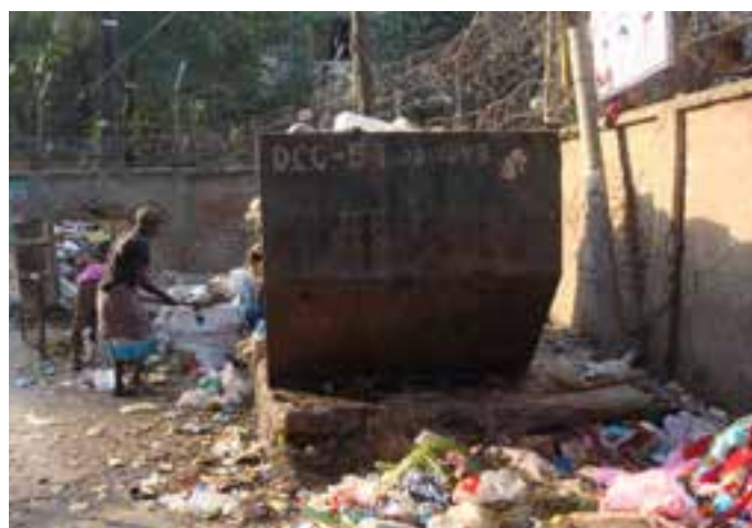
While an elderly cleaner rakes strewn rubbish into the DCC supplies disposal container in Dhaka, a younger cleaner scavenges for items of re-saleable value.

the young. As one respondent aged 24–25 put it: 'Our father's understanding of a barrier is that nothing should come between him holding the job and his son holding the same job after him. He has no idea that he himself is a barrier to our wishes.'