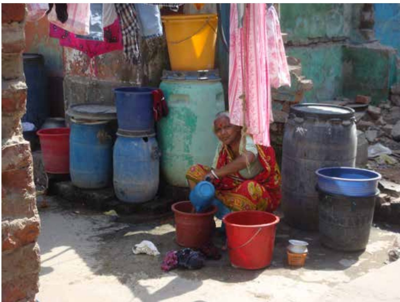
In a DCC cleaners’ residential area, an elderly women washes clothes with rationed water.

Dalit women who do not work are also at risk of violence and are often extremely poor. Many face domestic violence, which is also very common among the wider community. However, dalit women find it particularly difficult to get any form of legal support. For example, they face discriminatory attitudes when filing cases at police stations (which often refuse to take up their case, referring them instead to local authorities). Dalit women who are not Bengali are further disadvantaged, since their access to information is constrained by language and lack of links to the wider community, and they generally do not have the possibility of support from family living elsewhere in Bangladesh.