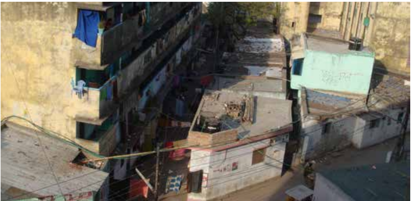
Congested living in an old multi-storey building and other types of accommodation in Dhaka City Corporation cleaners' staff residential area at Gonoktuli Lane, Azimpur, Dhaka

Several huge and old housing complexes remain. All have sub-divisions according to the identity of the people accommodated there. Peoples' place of residence is thus strongly linked to their occupation, although this seems to be changing as people diversify their income sources and new people move into these areas (often as sub-tenants).