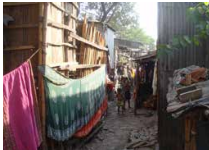
Substandard living conditions in housing at Lalbagh Shoshanghat, Lalbagh, Dhaka.

Even where water and sanitation projects have been promoted in the living areas of the DCC cleaners, the additional costs often have had to be borne by the residents. Some of the DCC residential staff quarters have been brought under water and sanitation projects such as Second Small-Scale Water Resources Development Project. 23 The residents, however, were critical about this and other similar projects as they have to pay the community welfare association for new services while the DCC already deducts Tk.100 from their salaries for all amenities.