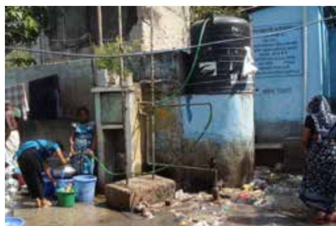
Water source and community toilets provided for women by the DCC in collaboration with an NGO. A woman wades through rubbish to reach a toilet, while water containers are lined up, and a young girl washes household items with water from the overhead storage tank.

Overall, there is a huge need for greater consultation with communities in the construction of new housing and provision of other services for the DCC cleaners. It is essential to address the specific needs of women, people with disabilities, and since people live in these areas all their lives, of the elderly. Housing has to be both adequate and acceptable to the intended inhabitants. Other institutions such as Dhaka University have built flats with running water and plumbing for their employees, including cleaners. There seems to be no reason why these facilities should not also be provided for the DCC employees.