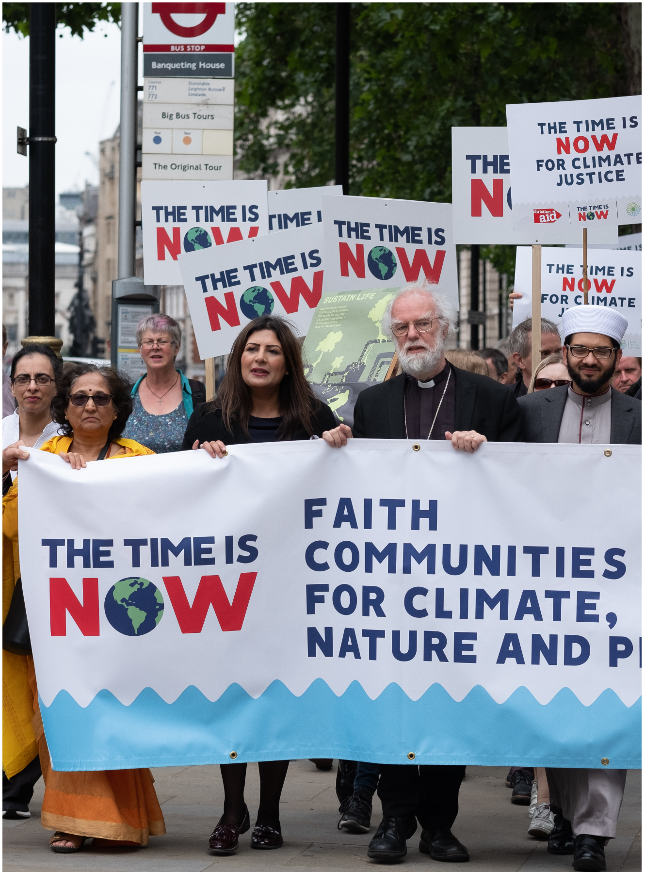
Below: The Time is Now mass lobby of UK Parliament on the climate emergency, 26 June 2019, coordinated by the Climate Coalition.