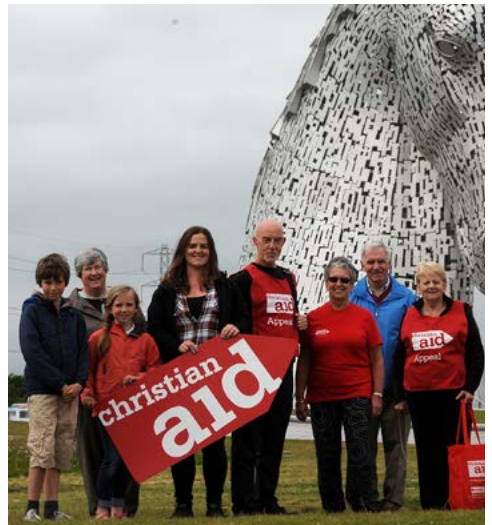
The Kelpies Canter – one of three new Christian Aid Scotland events.

In 2017, we'll continue to live, act and pray 'another way' until it impacts not just our giving but our daily lives. Keep an eye on our website for how you can get involved.