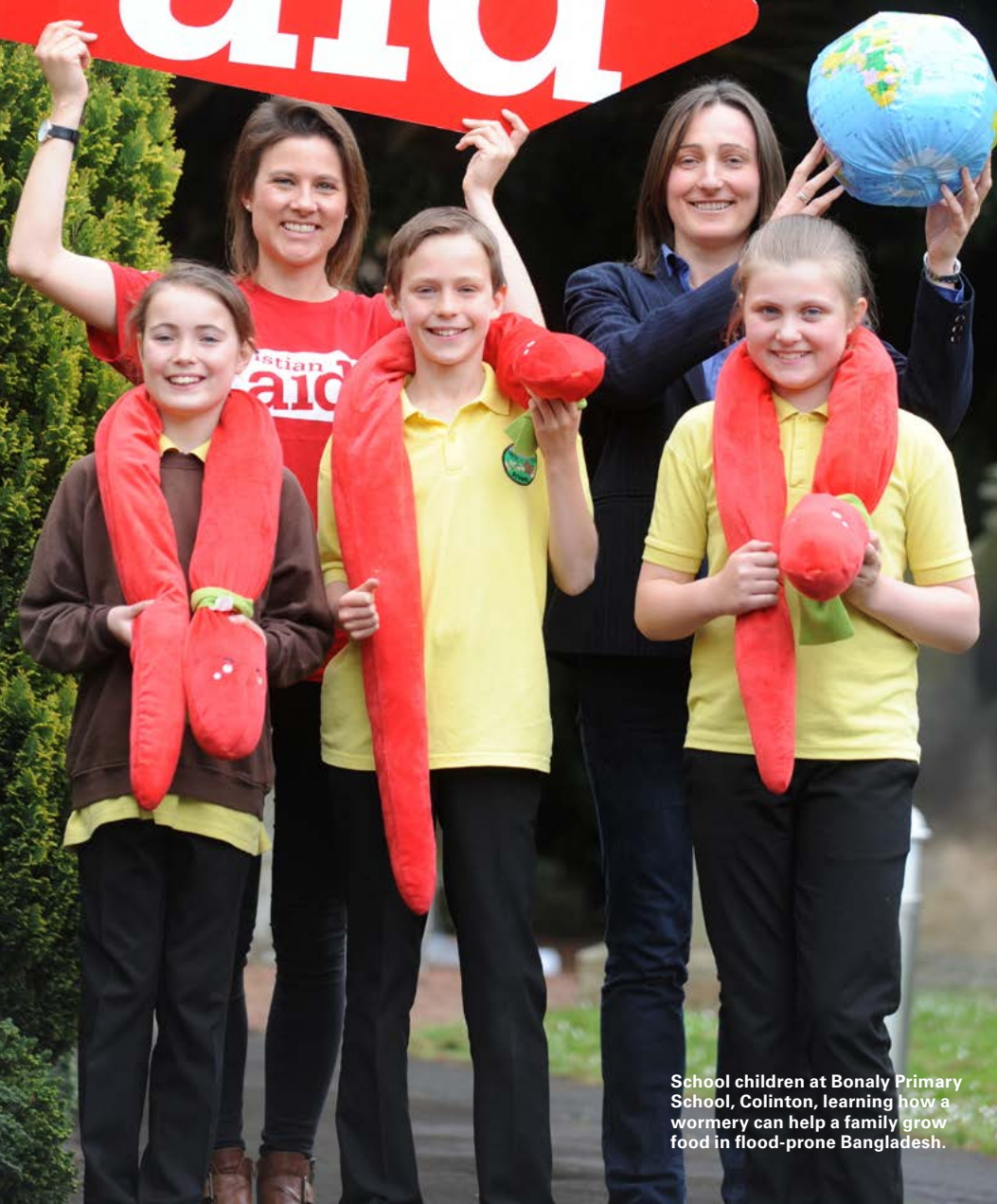
School children at Bonaly Primary School, Colinton, learning how a wormery can help a family grow food in flood-prone Bangladesh.