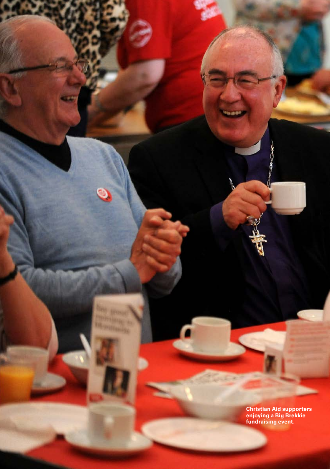
Christian Aid supporters enjoying a Big Brekkie fundraising event.