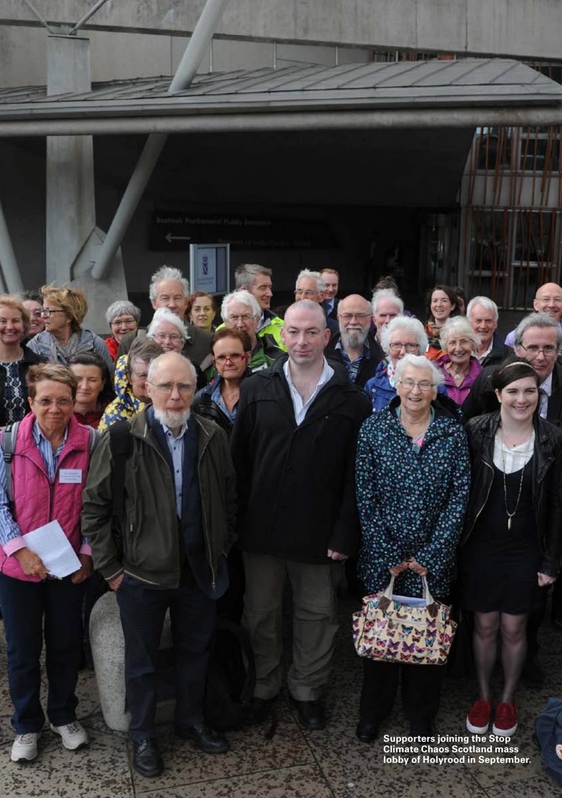
Supporters joining the Stop Climate Chaos Scotland mass lobby of Holyrood in September.