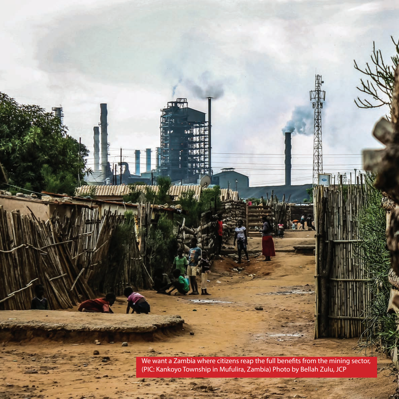
We want a Zambia where citizens reap the full benefits from the mining sector, (PIC: Kankoyo Township in Mufulira, Zambia)