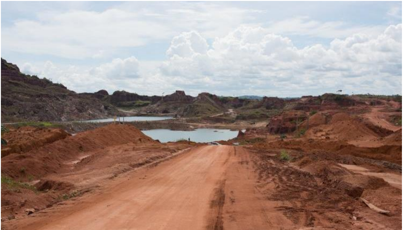
Above: A mine site in Ariquemes, Rondônia state, Brazil. Mining, cattle ranching and soya cultivation have resulted in Rondônia becoming one of the most deforested places in the Amazon, and caused tensions and violence between the migrant and indigenous populations.

Former UN Secretary-General Ban Ki Moon, among others, has acknowledged that climate change is the ‘defining issue of our time.’ In his report, Progress Towards the Sustainable Development Goals , he states that: ‘Climate change presents the single biggest threat to development, and its widespread, unprecedented impacts disproportionately burden the poorest and most vulnerable. Urgent action to combat climate change and minimize its disruptions is integral to the successful implementation of the Sustainable Development Goals.’ 169