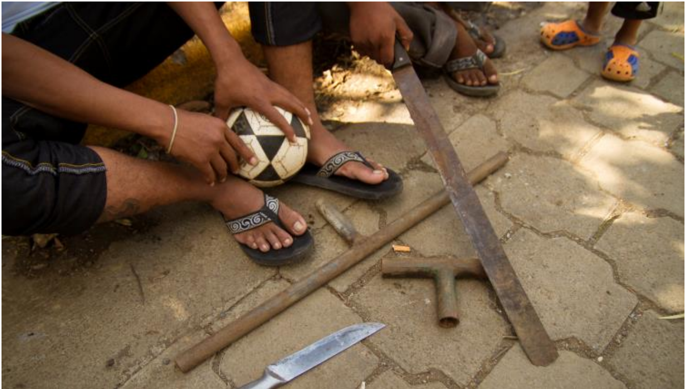
Above: Young men display their home-made weapons in a deprived neighbourhood of Managua.

Ending violence is a key objective within the SDGs. 99 For example, Goal 5.2 seeks to ‘Eliminate all forms of violence against all women and girls in the public and private spheres, including trafficking and sexual and other types of exploitation’.