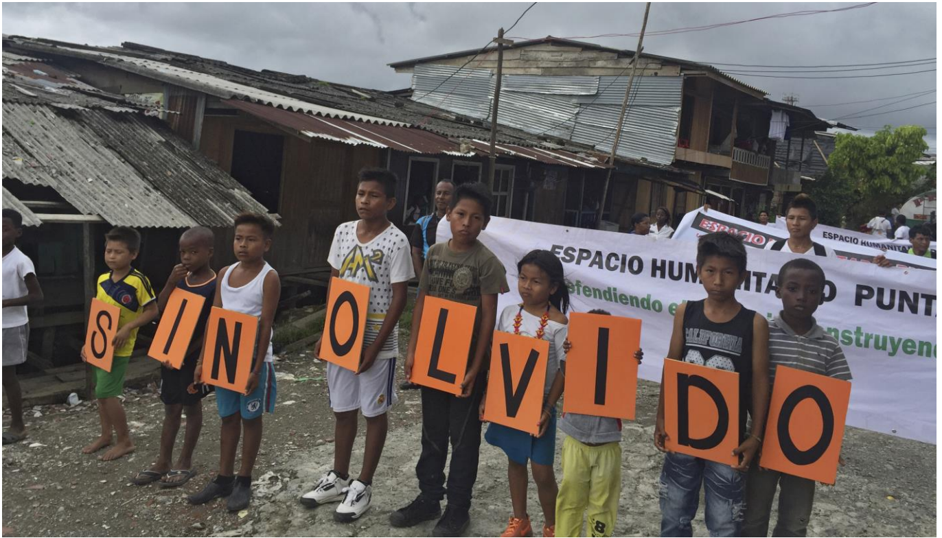
Above: Indigenous and Afro-descendent children at the event marking the extension of the 'humanitarian space' in Buenaventura to include the community port of Punta Icaoco. They hold up a sign which translates as 'Lest we forget', referring to the history of human rights violations

Inequality is not simply about income maldistribution, but is primarily an issue of who controls power. Using macroeconomic indicators for measuring inequality is deficient, because it does not capture this. The abuse of power has led to major corruption scandals in Brazil, Honduras and Guatemala, triggering widespread protests. And yet instead of reform, these led to crackdowns and shrinking civil society space. This provides a stark warning about rising populism or increasing support for less democratically minded leaders in Latin America and the Caribbean. Unless reforms are carried out, it is likely that the region's electorate will vote not just for a comedian like Jimmy Morales (in Guatemala), or force a postponement of the vote, as occurred in Haiti, but more worryingly vote into power candidates like Donald Trump in the US or Rodrigo Duterte in the Philippines. This suggests that the region has much work to do to fulfil SDG 16: 'Promote peaceful and inclusive societies for sustainable development, the provision of access to justice for all, and building effective, accountable institutions at all levels'. 60