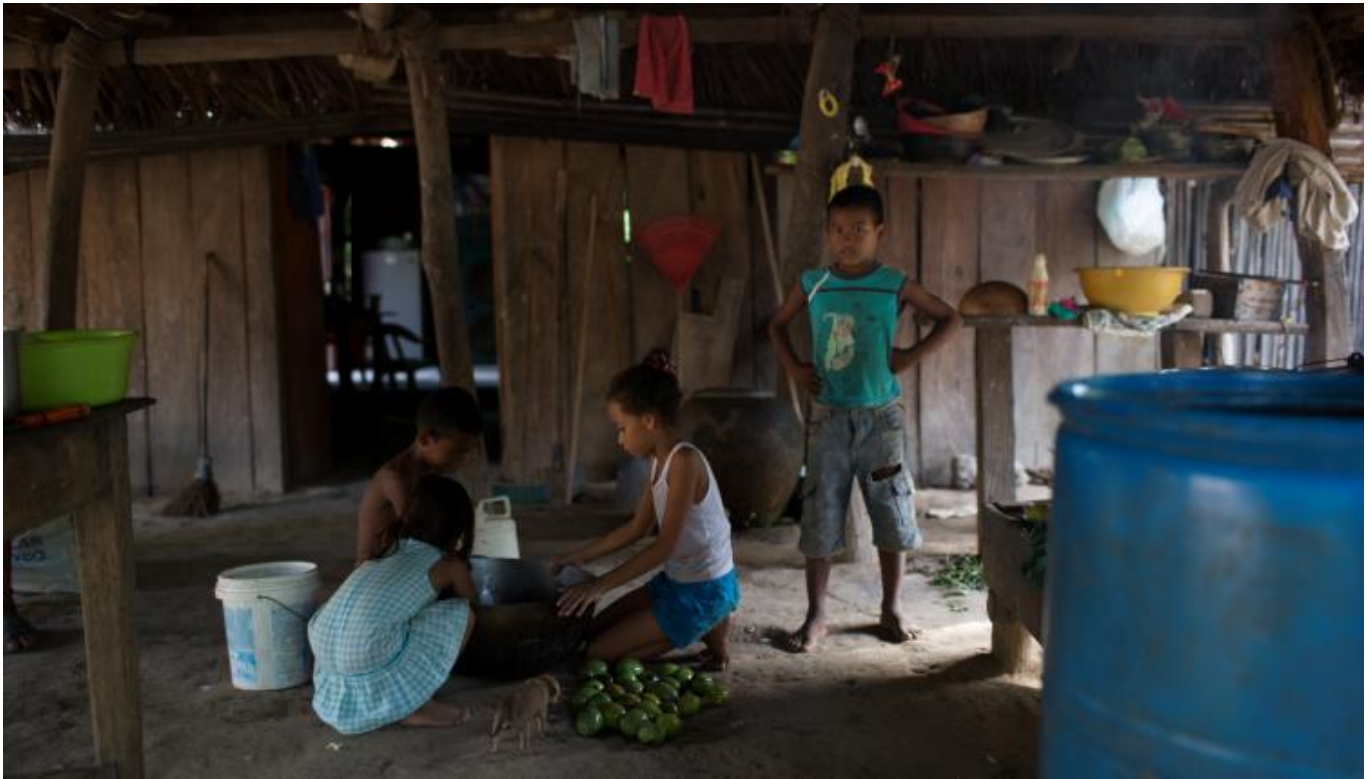
Above: A typical family home in Buenos Aires, Colombia. Christian Aid partner Corambiente screens children and provides deworming medicine and food supplements.

Life chances in Latin America and the Caribbean are very much bound up with where you are born and your identity, including gender, ethnic group, race, faith or sexuality. Income inequality is one part of the picture, but there are huge gaps in access to basic services (healthcare and education), in social security (pensions and maternity cover), and in access to employment or markets to sell produce. Women suffer disproportionately from the effects of poverty, marginalisation, climate change, discrimination and violence.