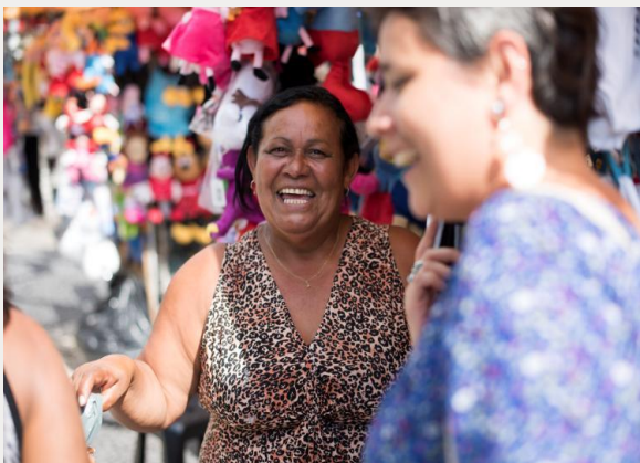
Above: One of the street vendors in São Paulo.

In São Paulo, Christian Aid's partner Gaspar Garcia Human Rights Centre (CGGDH) works with some of the most excluded categories of informal workers in the city, including Bolivian migrants, often working in conditions of semi-slavery.