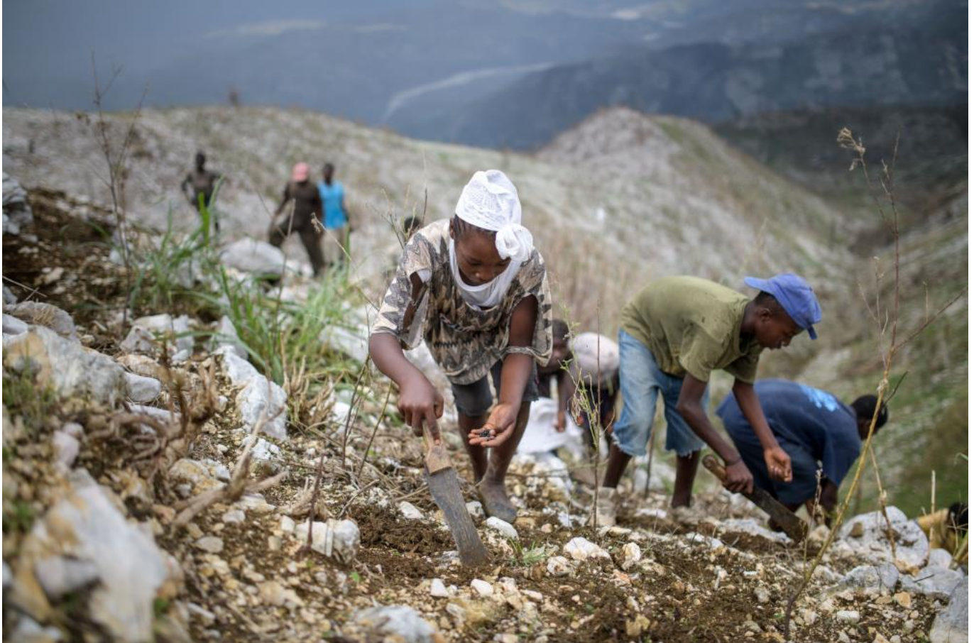
Above: A family planting bean seeds in a very steep slope in the village of Despagne near Jeremie in Haiti.

Everyone should have access to quality and secure employment, access to labour markets with equal opportunities, and a fair share of the benefits of economic growth. The link between decent work and development has come to the fore as one of the most effective ways to ensure that the benefits of development are shared. 148