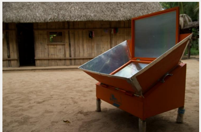
Above: A solar oven provided by Christian Aid's partner Soluciones Prácticas to a family in the pilot project.

To this end, Christian Aid, through national organisations Inti Illimani, Soluciones Prácticas, Centro de Investigación y Promoción del Campesinado and the Plataforma Boliviana Frente al Cambio