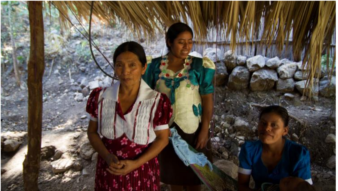
Above: Members of the Ch'orti' communities in Guatemala.

Latin America and the Caribbean is a racially and ethnically diverse region. There are at least 44.8 million indigenous people and 150 million of African descent, 22 together representing over 30% of the region's population. 23 Indigenous populations are largest in Mexico, Peru, Bolivia and Guatemala, 24 and there are approximately 420 indigenous languages spoken in the region. 25 In Latin American countries such as Brazil, Venezuela and the Dominican Republic, more than half the population is black. 26