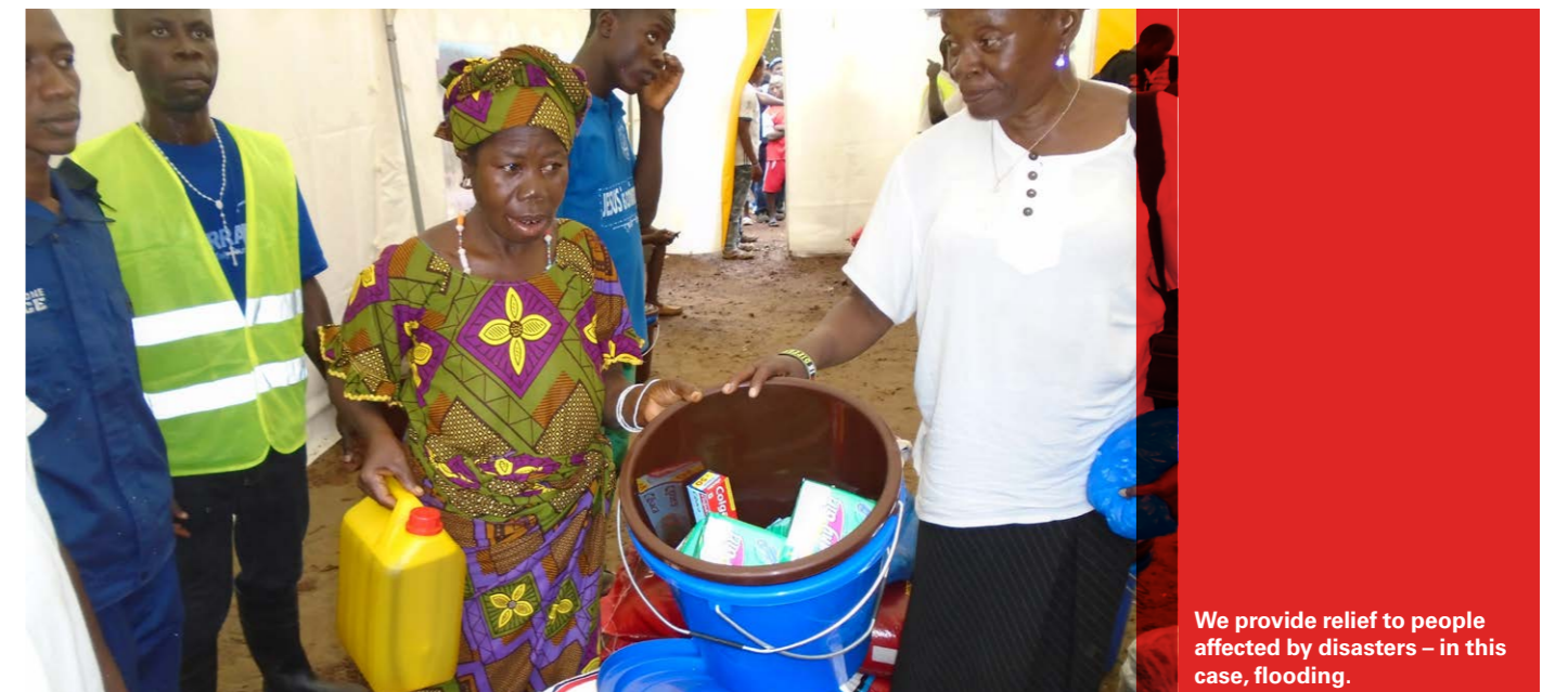
We provide relief to people affected by disasters – in this case, flooding.

Christian Aid Sierra Leone has expertise in strengthening civil society networks, accountable governance, community health, resilient livelihoods, and emergency preparedness and response. Gender sensitivity cuts across our programme.