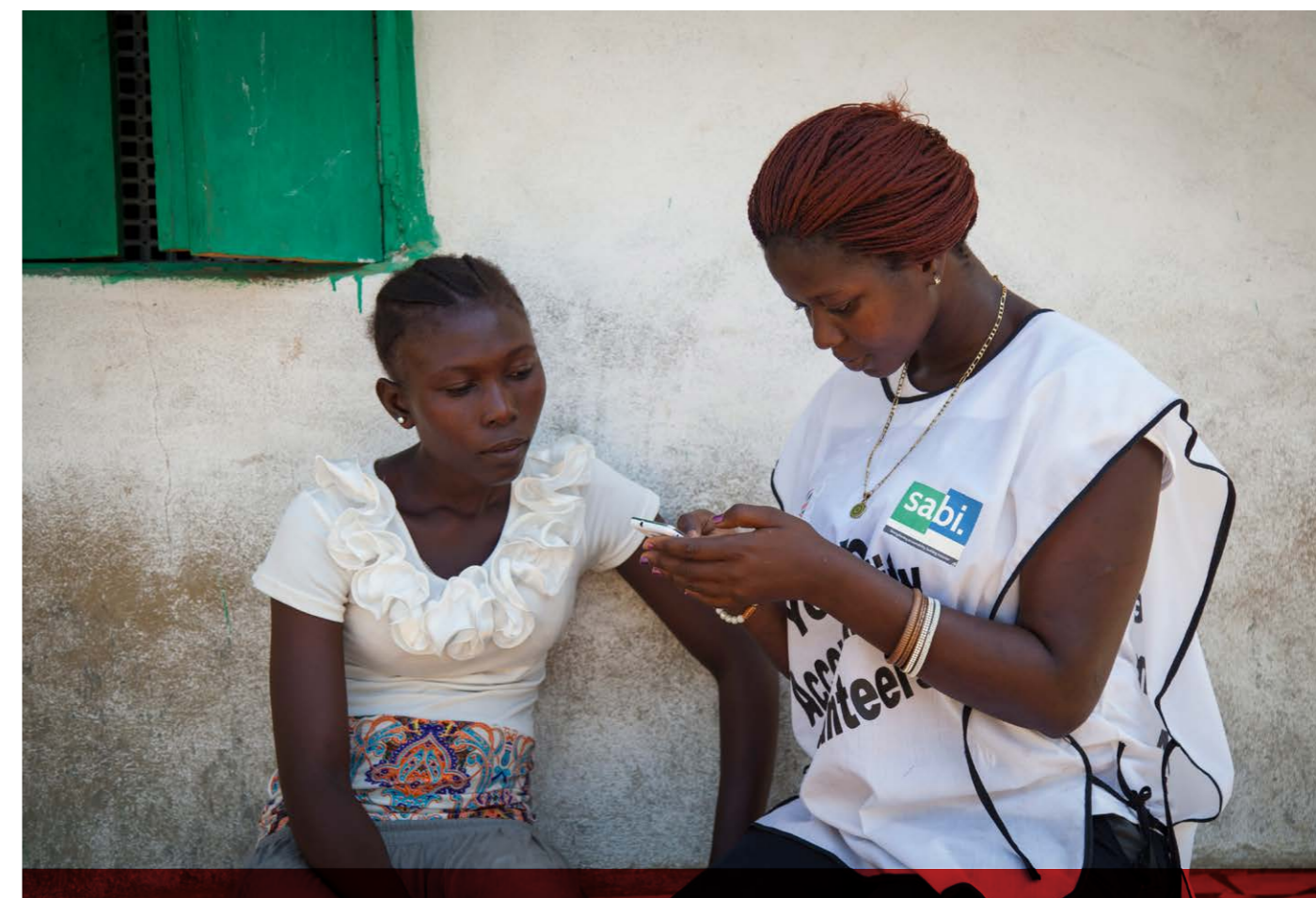
SABI carried out a citizen perception survey, gathering the views of people from every district of Sierra Leone to inform advocacy efforts.

'I have served enough in local governance; it is now time for me to go to the next level and I want to give a chance to other women to serve in local government positions. I think I am now mature enough to represent my people in Parliament.'