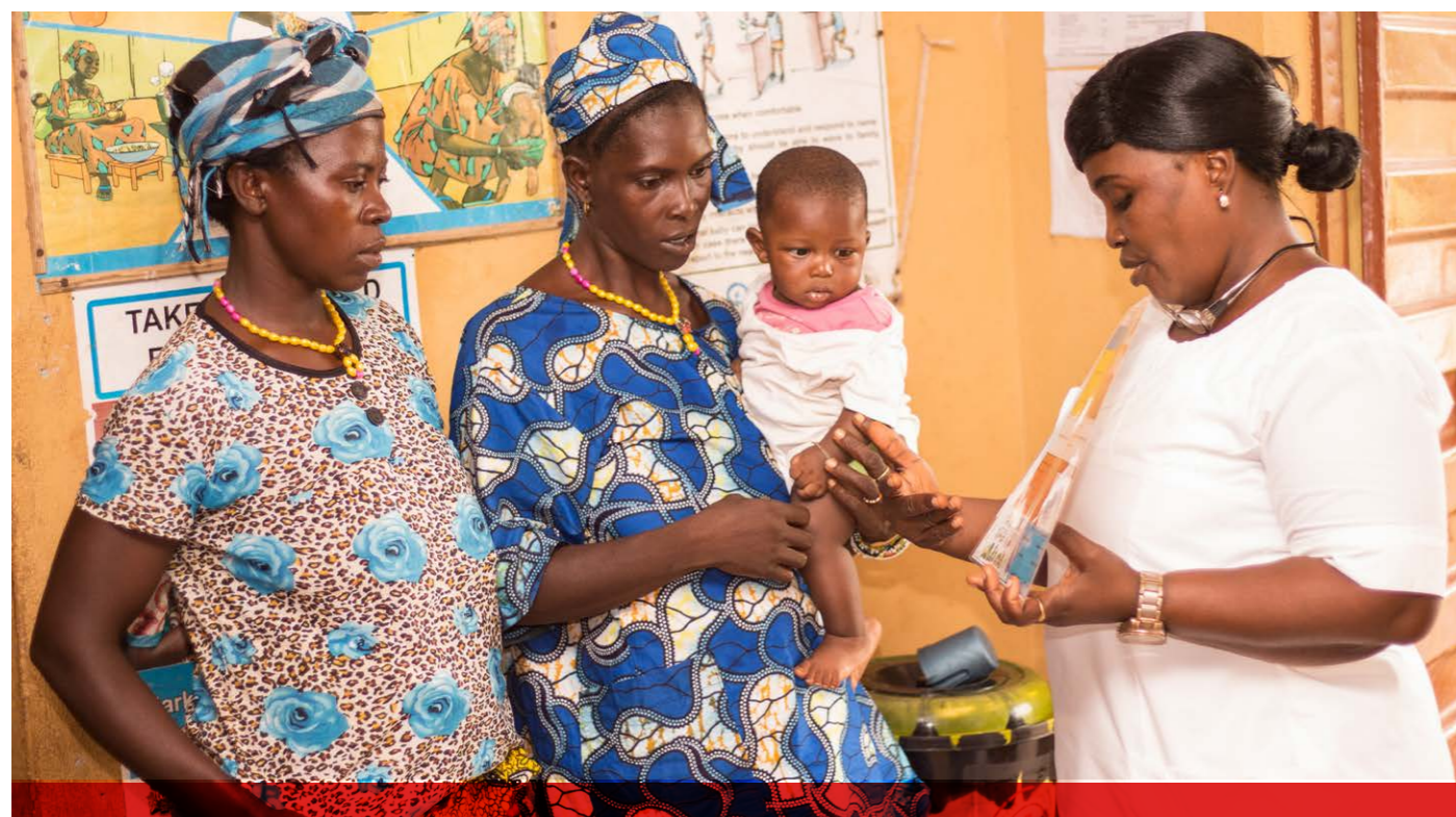
The SABI programme is empowering communities to demand better health services.

'I thought [after surviving Ebola], I should not be bothered about HIV. I have learned a lot about HIV and I now know that everyone is at risk... I have taken the bold step to go for an HIV test and I have also taken my partner for the test.' A male Ebola survivor in Pujehun District