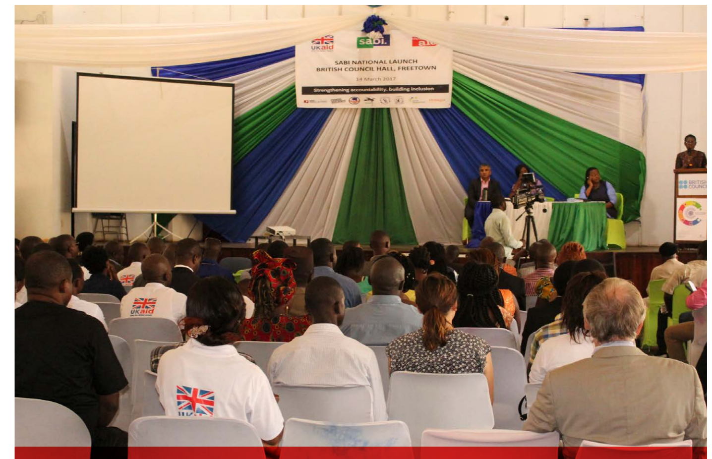
SABI was launched in 2017.

The project has been extended until 2020. In the immediate post-Ebola recovery period and beyond, Christian Aid Sierra Leone will implement, through its five partners, activities that will deliver change on all three of Irish Aid's objectives: accountable governance, tackling violence and building peace, and gender. We will contribute to conflict transformation, promoting women's empowerment, providing platforms for meaningful civic, state and policy dialogues, economic empowerment and improved social services delivery especially in the area of health.