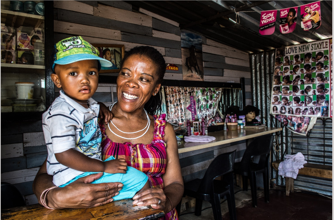
A woman who was supported by the Studies in Poverty and Inequality Institute (SPII) to strengthen her own business within a shackdwelling community in Evaton, near Johannesburg, South Africa. SPII, a think tank set up in 2006, provided trainings to small enterprises such as hers, including financial literacy and business management skills, and mentoring, which also served as evidence for local government policy recommendations.

Studies in Poverty and Inequality Institute (SPII) is a research think tank set up in 2006. It has a cross-sectoral approach, bringing together policymakers, academics and CSOs to identify gaps in knowledge and to carry out research on poverty and inequality to inform policy in Southern Africa. SPII is well positioned to be both nationally influential and internationally relevant, and is involved at the highest level of policymaking.