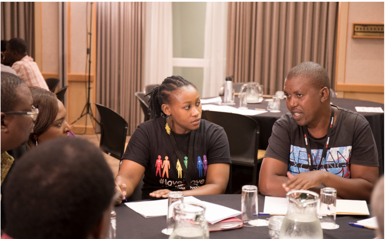
Community activists at a 2018 ACT Ubumbano community learning exchange event in Johannesburg, South Africa sharing experiences, knowledge and tactics with other activists.

By March 2020 ACT Ubumbano had registered officially. The advisory group of eight Southern African partners and three E8 partners had evolved to become the ACT Ubumbano board, with the Southern African partners in the positions of chair, vice chair and secretary. Work is still under way to further clarify the distribution of power between staff, board members and ordinary members. For example, discussions are ongoing as to how the board is selected and who the representatives should be. The model is jointly owned by northern and southern members, but its agenda is driven by the Southern representatives.