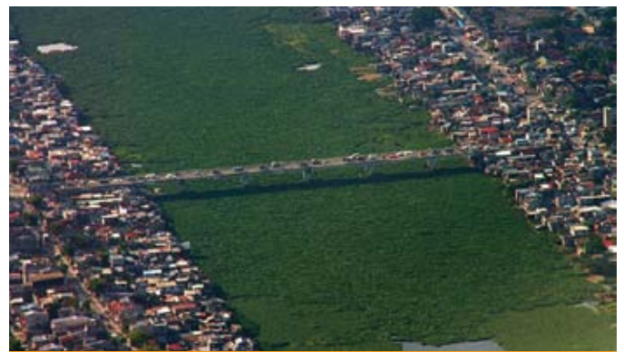
Pollution in a river that flows into Laguna de Bay, near Manila.

Nitrogen fertilisers and intensive livestock farming are a major source of nitrate pollution in water bodies. One example is that of Laguna de Bay, a large lake near the Philippine capital Manila. Intensive farming practices relying on chemical fertilisers were introduced in the surrounding areas in the 1970s. A decade later excessive run off of nitrates had caused severe eutrophication and algal blooms in the lake. The marine life of the lake was being steadily suffocated. The Philippine Government has taken steps in recent years to tackle the pollution, which is also caused by effluent from factories and the release of untreated sewage from adjacent residential areas, but the problem still persists. The situation is a major concern for the lake's aquaculture industry, which supplies the nearby capital with fish. A recent survey conducted in China looked at the level of nitrates in groundwater at 600 sites in 20 counties where the level of fertiliser use in agriculture was high. It found that at nearly half of the sites nitrate levels were above 50mg/l, which is the maximum safe level in developed countries. High levels of nitrates and nitrites in drinking water can cause 'blue-baby' syndrome. 30