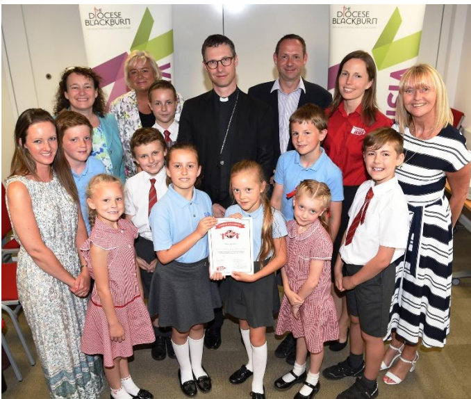
The first two schools in the country to achieve Global Neighbours Bronze Awards: Wilson’s Endowed CE Primary School and Whittle-le-Woods CE Primary School

As educators we must consider how to channel this righteous ‘table turning’ anger in constructive ways that harness the energy of youth but never patronise or put limits on their passion.